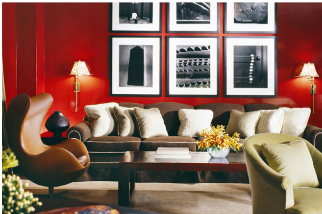
In a Park Avenue apartment, a vibrant red sets off photographs by Abelardo Morrell. The coffee table is custom made and the leather Egg chair is by Arne Jacobson.